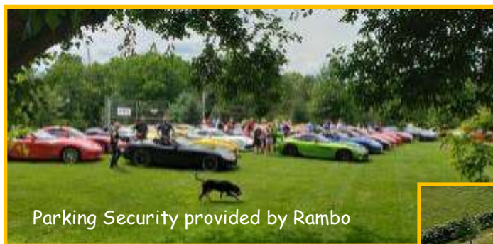
Parking Security provided by Rambo