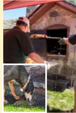
Rambo volunteered for clean up around the smokehouse.